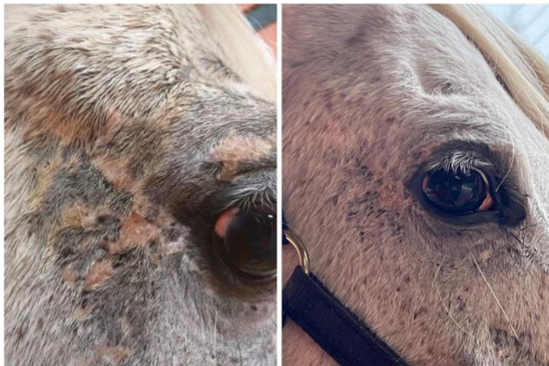
Before & after three weeks with the METASOMER Topical Gel

This horse had a skin issue for eight years. Note the vast improvement after just three weeks with the METASOMER Topical Gel – essentially NANO SOMA with edible Xanthan gum added.