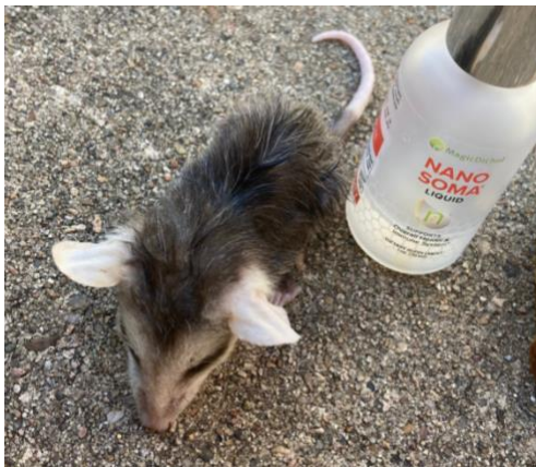
An orphaned opossum reviving after NANO SOMA

To read more testimonials about how the MagicDichol Family of Products has supported both animals and humans, click here.