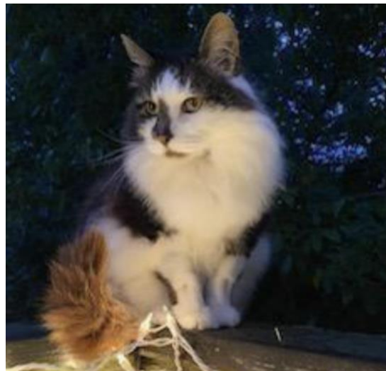
Joey after taking NANO SOMA

“The transformation of my cat 'Joey' has shaken my world. Joey is 15 years old and has been declining in health for the last few years... Ten days ago, Joey appeared to have what might be considered a stroke or was in a coma. He was in an upstairs bedroom in a frozen state, lying on his stomach with his head between his paws. He was immobile for two hours. I moved him to a couch in the middle of the night where I gave him spine massages until the morning.