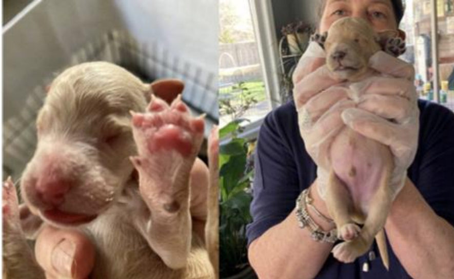
Hypoglycemic puppy after NANO SOMA

“I had a litter of puppies and one was born hypoglycemic, with blood-red paws, face etc. Instead of using high fructose corn syrup to bring the glucose levels up, I used .75 mL of NANO SOMA. I put it on the puppy’s lips and watched in awe as the pigment began to fill in the blood-red places. The puppy is developing normally with proper weight gain, nursing beautifully, and seems content. He looks just like his nine siblings now, six days later.”